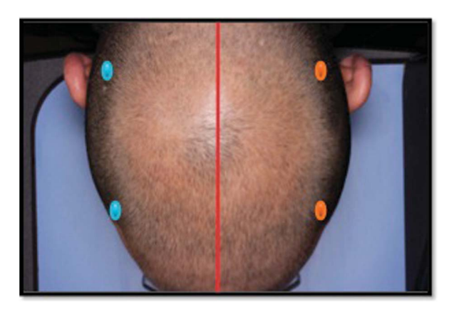
Figure 1. Two identical circular areas of 1 \times 1 cm (1 frontal and 1 occipital) in both the treatment and control half heads were defined for TrichoScan analysis. The patient received treatment with PRP on the right half head and the placebo on the left half head (Group A).

Briefly, to prepare PRP, 18 mL of peripheral blood was transferred to a tube with 2 mL of 3.8% sodium citrate.